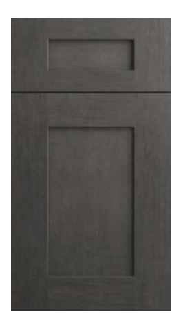
Smoky Grey EB02

Perfect for either traditional or contemporary décor, Elegant cabinets feature a wide shaker style and full overlay. In addition, the wide rails add a blend of strength and character, seasoned with a noticeable charm and elegance.