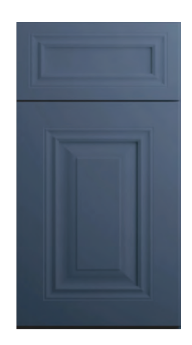
Ocean PB27 *Coming Soon