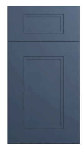
Ocean FB27 *Coming Soon