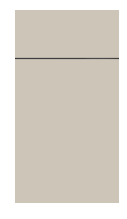
Sand M42 Matte *Coming Soon